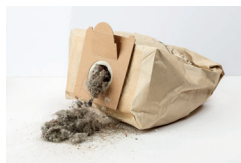
Vacuum cleaner bags